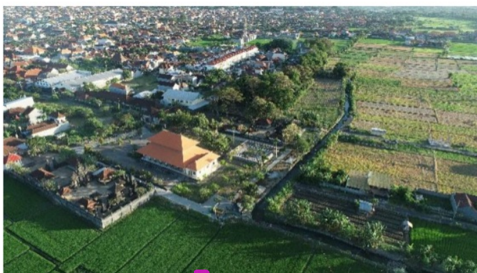
Figure 1. Research Location

This research took place in the Loloan river area (Figure 1), around the Renon Village. This location was taken because this area is under development as a tourist attraction area for Renon Village.