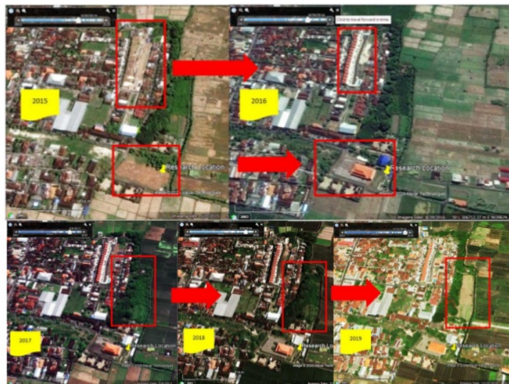
Figure 2. Land Conversion in Loloan River Area

Loloan River is one of the watersheds that flow in the Denpasar city with a river length of 3.75 km and irrigates 103 hectares of rice fields [3]. Characteristics of the Loloan River have a very flat riverbed slope (0.0032 in the upstream, 0.0032 in the midstream and 0.0025 in the downstream), a narrow river width (average 4.4 m in the upstream, 4.5 m in the midstream part and 9 m downstream) [5]. This situation causes a slow sediment rate that allows flooding if the sediment in the water body is not managed properly [6] [7] [8]. Coupled with changes in the function of land in the area around the river so that the management and arrangement of the river are needed to conserve the sustainability of the water potential of the area.