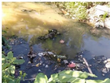
Figure 5. Pollution in Rivers due to Lack of Society Awareness