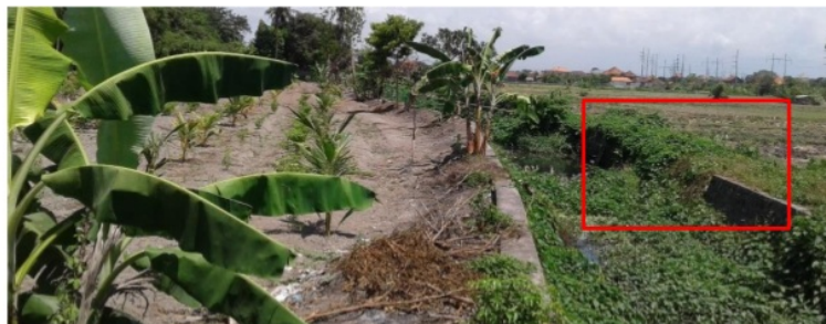
Figure 4. Damage in River Revetment and River Silting