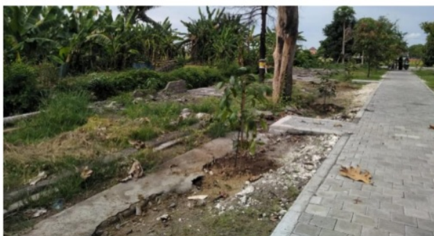
Figure 6. Environmental Conditions around the Loloan River