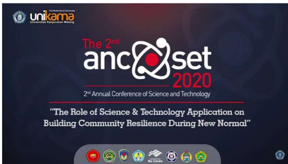
ANCOSET 2020 ~ 2nd Annual Conference of Science and Technology