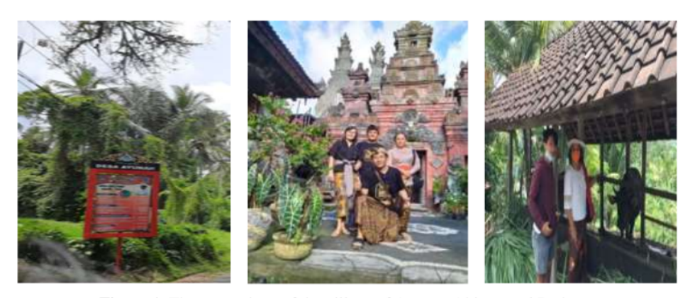
Figure 1. The atmosphere of the village of Ayunan Abiansemal Badung.

Bali cattle are germplasm that must be preserved which is supported by government policies. This is a golden opportunity for cattle breeders in Bali, because Bali is one of the sources of Bali cattle breeds and the only area that is believed to have pure Bali cattle genetics, [2]. More efficient marketing will be able to provide higher prices for farmers. Thus, a more efficient marketing system must absolutely be considered, so that cattle farms are able to provide higher additional income for farmers. This increase in income will encourage them to raise more cattle. In addition, it will encourage farmers to carry out maintenance in a better way, [3, 15].