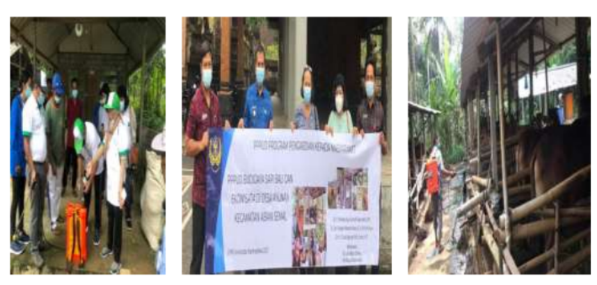
Figure 2. Fumigation activity in cow shed