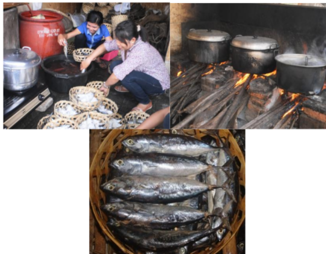
Figure 3. Process of salting, boiling, and frigate mackerel boiling

After the transaction is agreed between the big trader and the boiled fish maker then various equipment is prepared for the process of boiling fish. The equipment such as firewood and stove, large pots, bamboo baskets, while the other materials consist of fresh frigate mackerel, salt, and water for boiling and washing. The fish boil center in Kusamba is a place for processing fish to be boiled whose workers are mostly women.