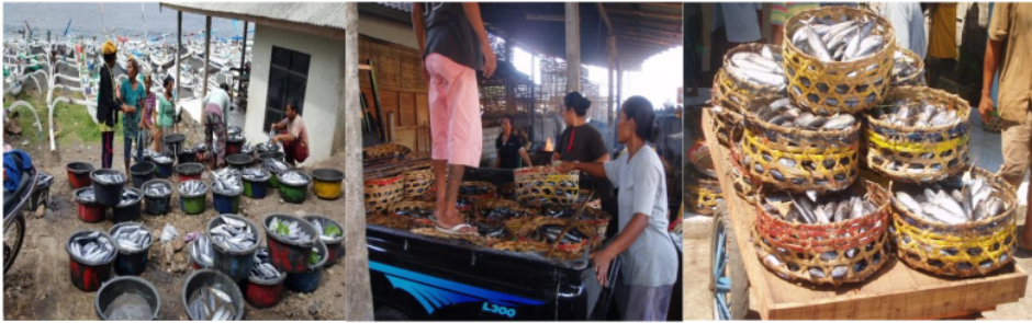
Figure 2. Transactions Process and frigate mackerel pickup

After arriving at the beach, the fish that is caught will be auctioned by the fishermen to the big traders who have been waiting.