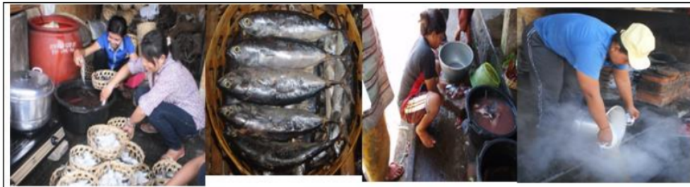
Figure 1. Pemindangan and its waste product: cleansing fish and salination (A), “ Pindang ” products in Kusamba (B), blood from fish processing (C), and wastewater from Pemindangan process (D).

The waste management is physically conducted by using filters made of iron wire. The iron-wired filters are installed between the drains based on their situation by which the solid wastes are filtered to be disposed of or placed in the ground. The filters are in the form of iron bars or strainers which are routinely supervised in order to dispose of the solid disposals. Chemically, waste management is performed by using chemical compound in the form of chlorine ( Cl_2 ). This process is done by using containers to which the liquid waste passed from the physical drains and left to sediment. During this phase, the solid particles from the waste will settle on the bottom of the containers while the unsoiled waste proceeds to the surface. In addition, some chlorine is also added as necessary. The liquid waste which is already on the surface after undergoing sedimentation proceeds to the next containers. On the other hand, the solid particles left on the bottom of the containers are routinely cleaned to prevent environmental pollution. Biologically, waste management is performed in the next containers by using aerator by which the aeration process can be completed in order for the microbes to be able to grow and develop.