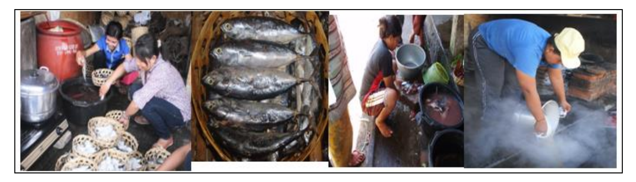
Figure 1. Pemindangan and its waste product: cleansing fish and salination (A), " Pindang " products in Kusamba (B), blood from fish processing (C), and wastewater from Pemindangan process (D).

IOP Conf. Series: Materials Science and Engineering 434 (2018) 012148 doi:10.1088/1757-899X/434/1/012148