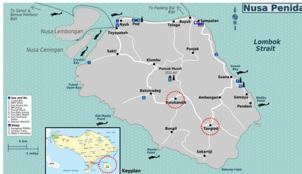
Figure 1. Locus of Research; Tanglad and Batukandik Villages, Nusa Penida