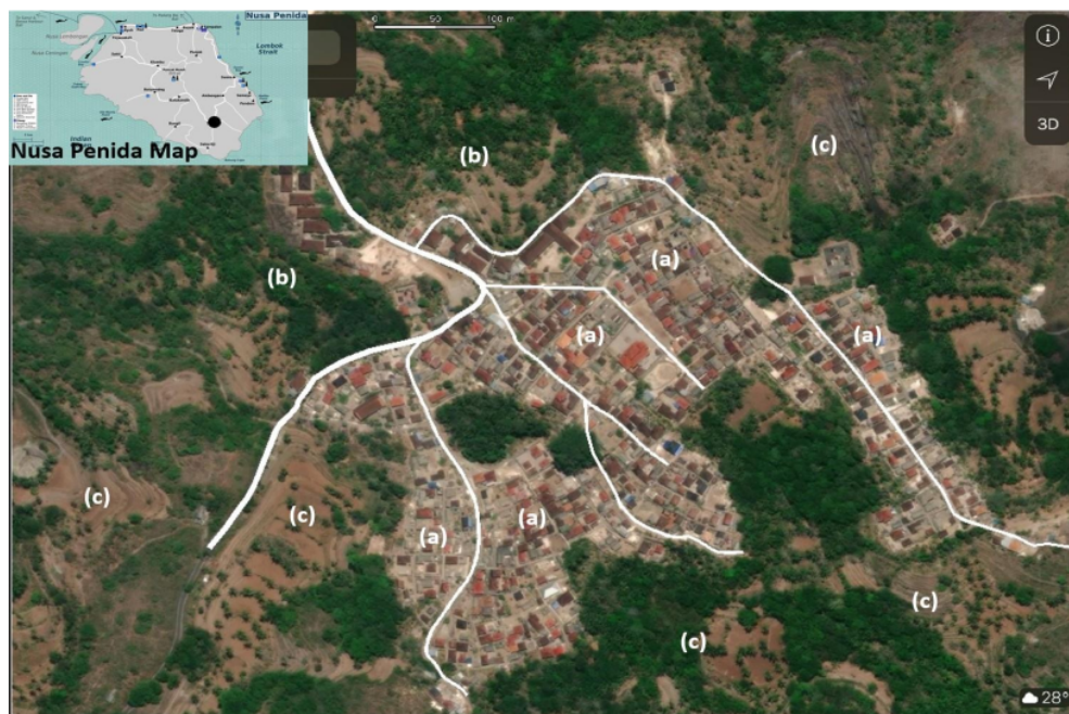
Figure 4. Tanglad Village Settlement Pattern, Nusa Penida: (a) flat and rocky land for residential housing; (b) higher land than its surroundings; (c) contoured land for agriculture

This phenomenon occurs in the vernacular settlements' spatial layout on Nusa Penida's island with hilly and valley natural conditions (see Figure 4 dan 5). Two cases in this study indicate that the contours of the topography influence settlement patterns. In zone selection, the highest outline tends to build shrines as the main or great part, and the residential dwellings are in the lower zone against the worship zone. They are respecting and maintaining the sacredness of a place of worship from a secular or profane context. Following Eliade (1957) statement, this sacred value is that the holy atmosphere can be maintained through its management. In this context, management is placing a shrine on land that is higher than the surrounding land.