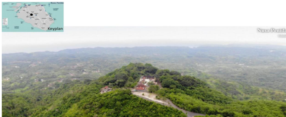
Figure 2. The Highest Contour in Nusa Penida is The Puncak Mundi Temple Area