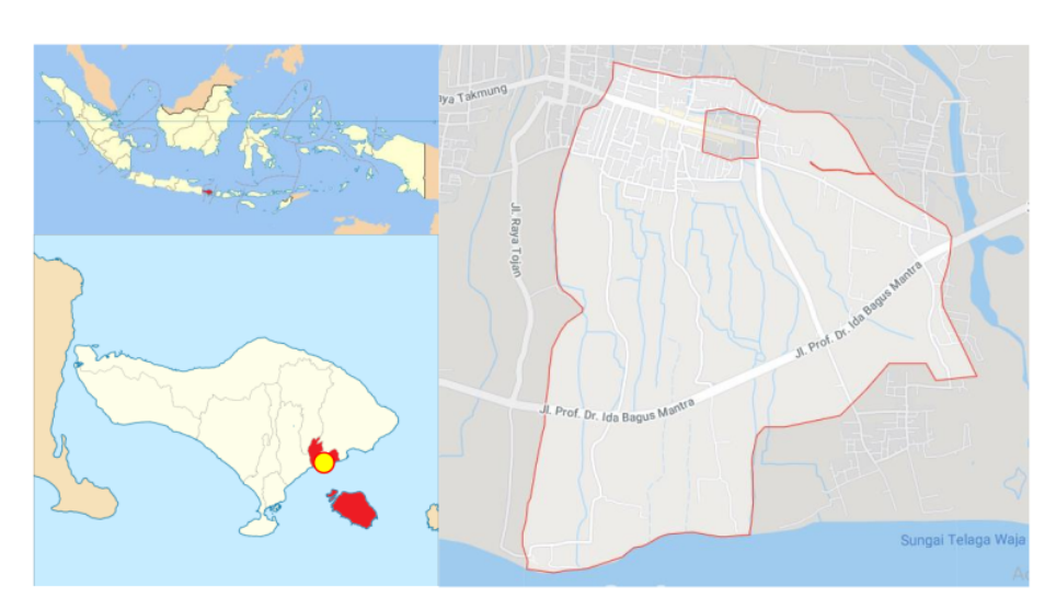
Figure 1. Map of Gelgel Village, Klungkung District, Bali, Indonesia

The prevalence of STH infection was assessed using distribution frequency table, and risk factor analyses then examined using Logistic regression and multiple regressions in SPSS 16.