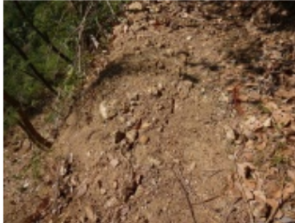
a. fault creep

conditions and its effect on the landslide occurrence. The model of this research has not ever been previously conducted on the Seraya volcanic rocks - especially in Sega village, Karangasem.