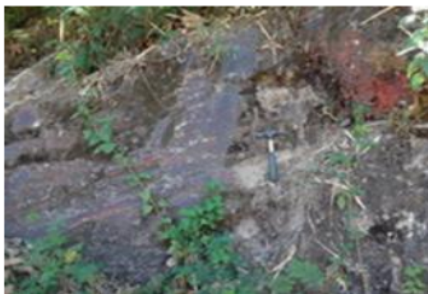
b. Shale outcrop bluish gray clay