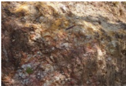
a. Sandstone silk with clay

Geologically, most of parts of Sega Village is composed of volcanic rocks in the form of products of old volcano formed in the early days of the quarter consisting of breccia sediment, lava, and tuff covering 47% of total region. The rock sediment covers 23% of total area with a few of limestone, surface sediment and intrusive rocks. The dominant rock types in Sega Village is silt sandstone and clay shale (Fig. 4 a), including andesite breccia that has experienced weathering due to denudation (Fig. 4 b). Meanwhile, the exposed formation of rocks in Sega Village in the research area consists of dark bluish dark gray clays. As stated by Wilopo and Agus (2005), the andesite rock and breccia are the factors triggering the occurrence of landslides for its waterproof. Thus the andesite and breccia rock can be used as a sliding plane for the occurrence of landslides. In a saturated state of the water in rainy season, coupled with the sandy loam soil texture on areas that have the andesite host rock is prone to landslides.