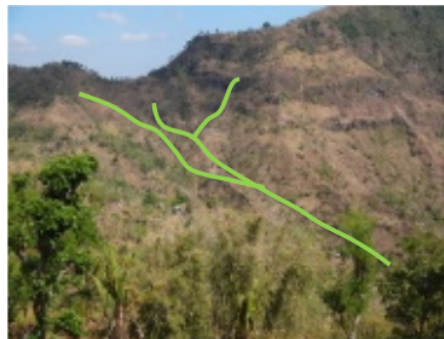
b. Debris flow