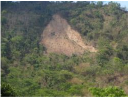
b. Translation into Debris flow