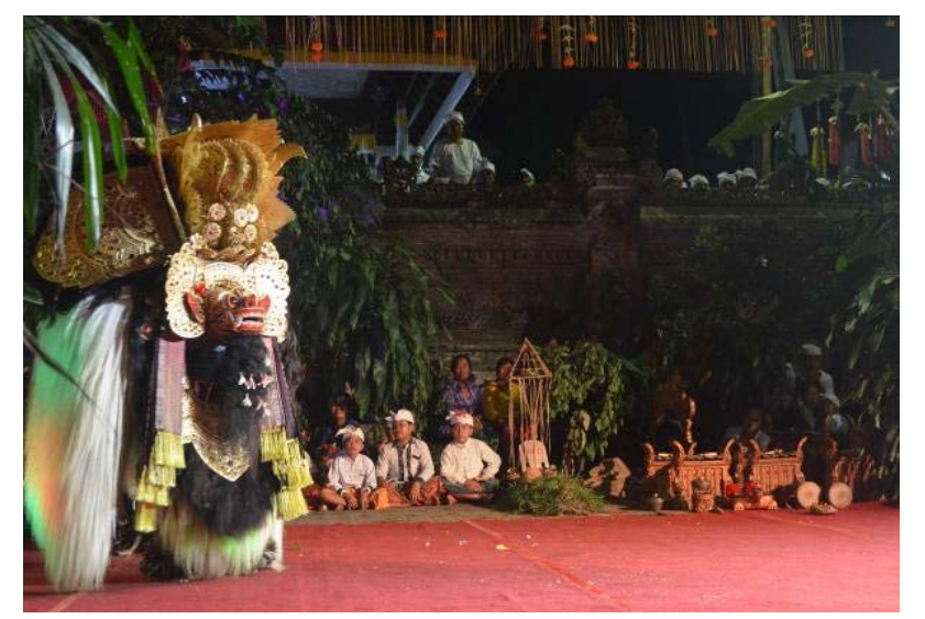
Figure 7. The community did not budge to watch until the Calonarang play was finished in the early morning (Right) (Documentation of the Research Team).

Figure 6. All community members, ranging from children, adults, and elderly people watching the Theatre of Calonarang by dressing up in Balinese traditional clothes