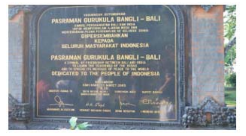
Figure 3. Inscription of Gurukula Foundation, which was built on the initiative of Bangli Regent, I Ketut Arnawa in 2003

Figure 2. Profane Barong Landung at the Museum Gurukula