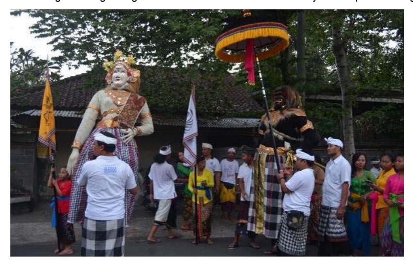
Figure 5. Barong Landung dialogue for women and men as in the story of Sampek and EngTay

Based on Figure 4 and 5 above. Dialogue between male and female Barong Landung representing Sampek and Engtay figures is held. Both are figures in traditional Chinese drama who have been adapted into various versions in Indonesia, including the manuscript rewritten by N. Riantiarno. Sampek and Engtay figures show the influence of Chinese culture in Bali. Other influences are seen in the use of kepeng which is the Chinese currency used as part of the ritual in Bangli. This influence is also witnessed during the reign of Jayapangus shown in the Pelinggih heritage in Pura Dalem Balingkang showing the characteristics of Chinese architecture. Music players are among teenagers who wear on traditional clothes: white udeng, white clothes and sarong. Old women and young women dress up neatly dressed in kebaya (Javanese-styled blouse), cloth, waist tied to a scarf, and carrying offerings on their heads.