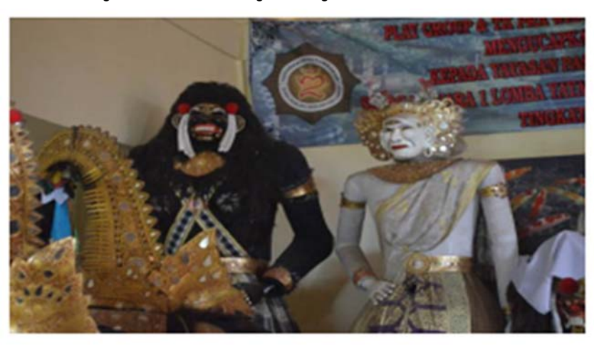
Figure 2. Profane Barong Landung at the Museum Gurukula