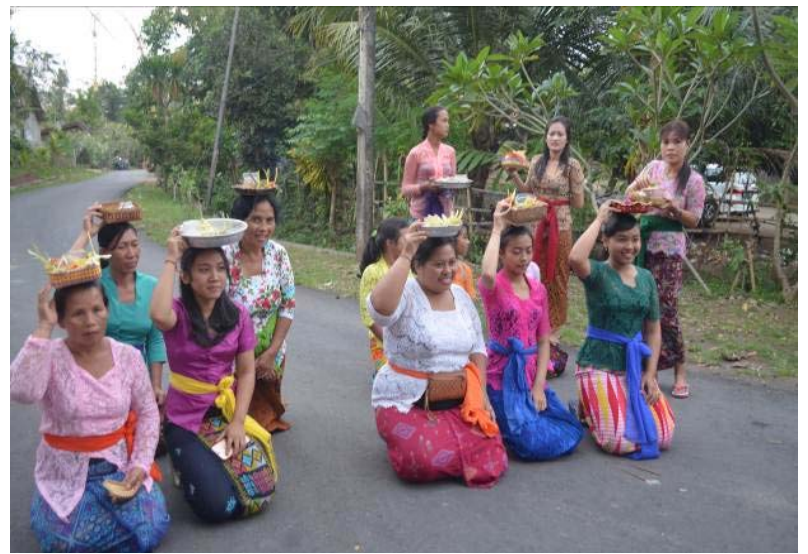
Figure 4. In front of the gate and the road the women offered offerings (canang sari) and money (sesari)

Barong Landung male and female players walk by initially presenting the offerings, accompanying with orchestration music, in the form of 2 drums, kecrek (a Bali traditional music instrument), gong, and canang (offering material), Barong Landung, is followed by the local residents.