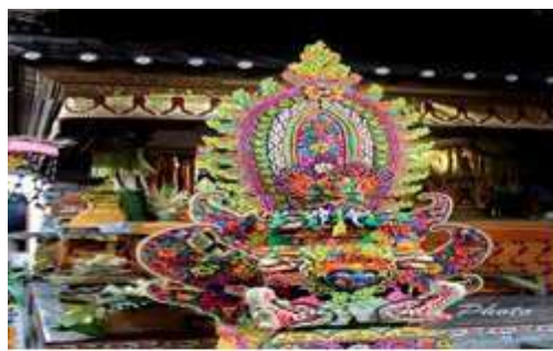
Figure A. Pregembal

The ceremony made in the city does not distinguish between the size of the bebantenan, but in the village, the ceremony for the formation of ceremonies can be done by the community, while the ceremony is considered to contain high magical meanings made by special people. The spending of money for small ceremonies can be done by the general public, while spending money for larger ceremonies is done by a special person. Where gender economic activity is associated with the eight characteristics (Asta iswaryanya) that accompany each life of the people.