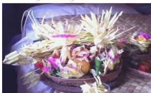
Figure B. Banten Otonan