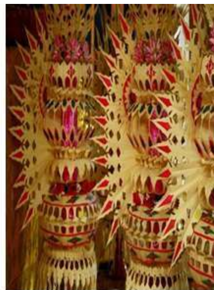
Figure C. Hiasan Janur

The comparison of interviews with religious literature guidelines in Bali that the implementation of yajna as in the form of yajna picture A, B.C not enough just known and understood it, but must be accompanied by pengayataannya, practice in the form of everyday behavior and the most important society. The intensity of prayer, prayerfulness, making upakāra will increase the attitude, morale and behavior towards a better and true quality of life in accordance with Dharma rules. Because each Upacara and Upakāra is a translation of the teachings of religion and has the essence of self-study, in organizing life and life, so that it can pursue the main goal of this birth, namely "Mokshartam Jagadhita" (welfare and happiness),