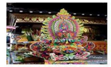
Figure A. Pregembal

The ceremony made in the city does not distinguish between the size of the bebantenan, but in the village, the ceremony for the formation of ceremonies can be done by the community, while the ceremony is considered to contain high magical meanings made by special people. The spending of money for small ceremonies can be done by the general public, while spending money for larger ceremonies is done by a special person. Where gender economic activity is associated with the eight characteristics (Astaa iswaryanya) that accompany each life of the people.