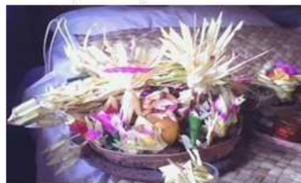
Figure B. Banten Otonan