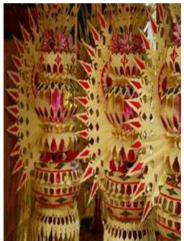
Figure C. Hiasan Janur

The comparison of interviews with religious literature guidelines in Bali that the implementation of yajna as in the form of yajna picture A, B.C not enough just known and understood it, but must be accompanied by pengayatannya, practice in the form of everyday behavior and the most important society. The intensity of prayer, prayerfulness, making upakāra will increase the attitude, morale and behavior towards a better and true quality of life in accordance with Dharma rules. Because each Upacara and Upakāra is a translation of the teachings of religion and has the essence of self-study, in organizing life and life, so that it can pursue the main goal of this birth, namely "Mokshartam Jagadhita" (welfare and happiness),