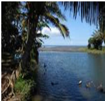
Fig 4. Estuary (Loloan)Petanu River

The society participation of Saba Village at this interactive level is the society directly involved in the implementation of the program. The village society of Saba has a duty in the activity. Participation for Incentives participation for Saba Villagers, at this incentive level is the community contributing labor and earning wages, in the process of facilitating facilities, cleaning and other activities such as, discussion activities involving all components of society.