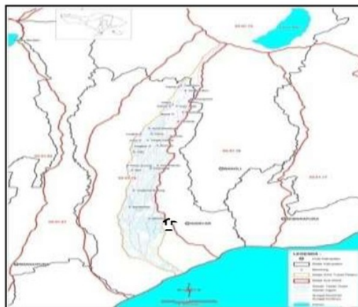
Fig 1. Map of the river basin and estuary of Petanu River

The results of the study using Arc. GIS 10 with a shapefile from the watershed area on the island of Bali, using the UTM 500 S coordinate system and the polygon calculation geometry, then calculated the area of each watershed polygon, the Petanu River Basin is 96,970 km 2 , with the main river length of 46.770 km. The morphological characteristic of the Watershed (DAS) is the character of the Petanu River form, which can be seen based on the width and shape of the watershed, the length of the river and the width of the watershed and the density of river flow and slope. Petanu watershed has an elongated morphological shape with a magnitude of RC (basin circularity) value of 0.27 to 0.46, meaning lower flooding fluctuations. Level of slope 0 - 8% (low flow velocity) and very steep > 40% (very high flow rate). Characteristics of soil type yellowish brown regosol. Petanu River is a river that cross the 2 districts of Bangli and Gianyar.