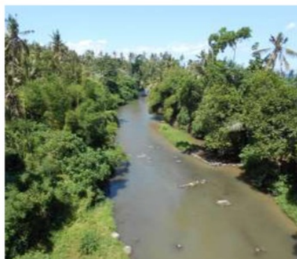
Fig 3. River Downstream Conditions In Saba Village

The raw water source from the river prior to use must meet the physical and chemical requirements. Transmission system from the surface water of a system that serves to deliver clean water from water sources (rivers / lakes) to the ground reservoir is then distributed to areas that require clean water. The way of water distribution depends on the location of the water source located downstream of Petanu River.