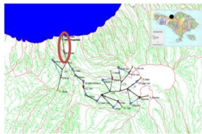
Figure 2 Map of the Water System in Saba Watershed

Based on the flow rate semimonthly for Saba River from AWLR post Seririt recording the data obtained during the dry season (September 1998-2012) amounted to 1,023 m 3 /sec, and the rainy season (January 1998-2012) amounted to 1.369 m 3 /sec or. The total discharge of water flow analysis semimonthly during the year amounted to 9.3 million m 3 /year.