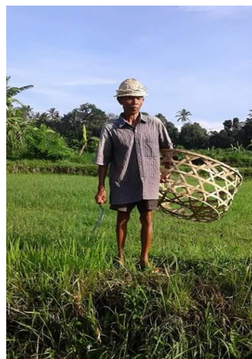
Figure 2. Workforce to look for feeds

The majority of the respondent breeders (100%) apply Artificial Insemination (AI) as a mating method. For one mating costs 50.000,- – 75.000 - IDR /brood with an average price of 52,880.12