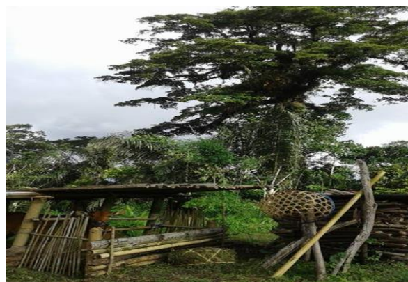
Figure 1. Individual Stall