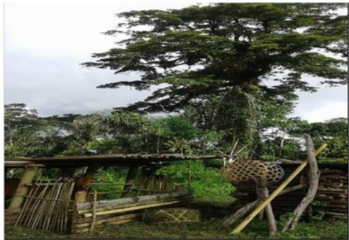
Figure 1. Individual Stall