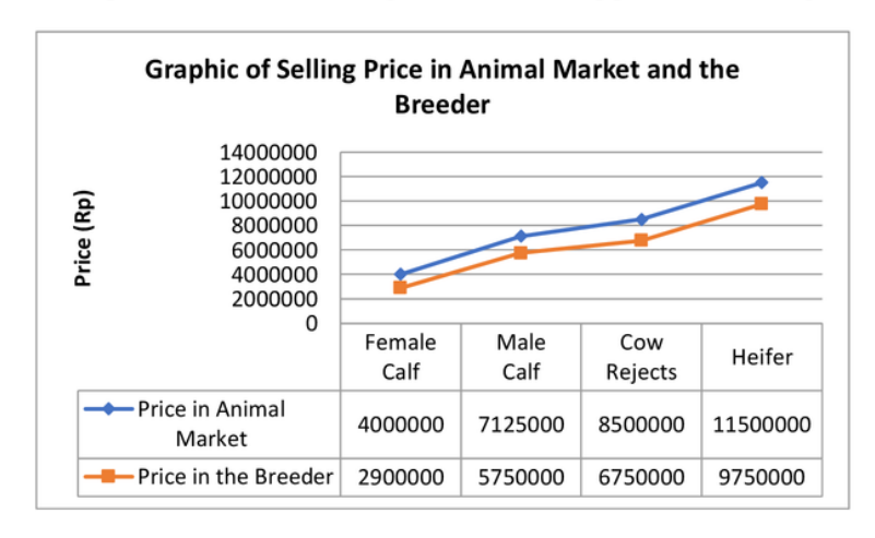
Figure 3. Different Selling Prices in the hand of the Breeder and Animal Market

However, such different prices have not able to motivate the breeders to sell their cattle to the animal market directly. It is due to they are afraid and they do not want to take any risk that their cattle may not be sold out (87.96%), they feel more comfortable and easy if they sell it in the stall (7.87%), and the other reason is the distance between the stall and the animal market, limited transportation line and anxiety to be fooled by the middleman in the animal market (4.17%). Such a feeling of fear to take the risk is due to the lack of entrepreneurship spirit of the breeders (Soekartawi, 1993) so that they always feel comfortable with the current condition. Significant difference in selling prices between the male and the female calf has led the breeders prefer to raise male calf to the female ones, and their investment may circulate rapidly. The male calf is raised for 1.5 - 2 years, and they can be sold at a high price, moreover, the breeders may forecast the selling price of their cattle during Idul Fitri Day , in which the selling price must be higher.