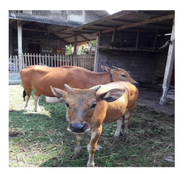
Figure 1. Bali cattle

Australia and New Zealand where huge land area are designated for livestock activity for global market Indonesia situation is quite different. Both land area and topography are not similar. On the other hand the 260 million population is certainly a good market for them. The government must have considered many factors including land area, farmer communities, market chains, management, financial, education, information accessibility and others. To promote the local farmers the government has also passed a law to stop importing from India unless in serious condition [6,7,8]. It is very important that every interested parties wherever they are to understand and cooperate with the government policy and intention. In line with the policy we decide to study the progress in Bali and specifically focus to Sembung Mengwi Badung village, Bali.