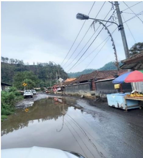
Figure. 4. Conditions for Disposal of Wastewater and runoff (No drainage available)