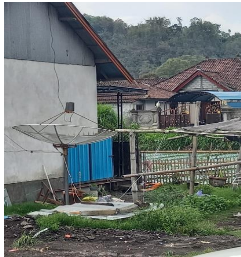
Figure. 5. Source of Clean Water (adjacent to sewage disposal)

Community empowerment efforts are to encourage people to be independent and have the ability to make their own decisions, take their initiatives, and improve their own lives. The involvement can be in the form of activities in the form of donations of thoughts, opinions, or actions, and it can also be in the form of cost-sharing, materials for the improvement of the