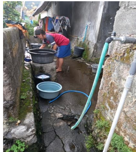
Figure. 3. Wastewater Disposal Conditions (Laundry)