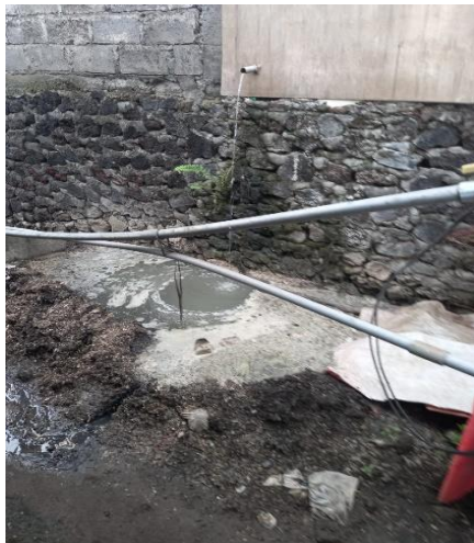
Figure. 2. Wastewater Disposal Conditions (Kitchen) adjacent to clean water sources

From the results of the author's field survey, There was found that the condition of the household wastewater treatment system in Songan A Village still needs further regulation. The sewerage for household waste is still not fully regulated, it is close to clean water sources, and the treatment of household waste has not been developed and integrated. The environmental drainage channel is also not yet available. The conditions of household waste disposal in Songan Village can be seen in Figure 2; 3; 4; 5: