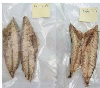
Figure 1. Changes in appearance and texture at the end of storage

The decrease in the appearance value from 8.7 on the 14th day, decreased to a value of 7.73 on the 28th day in the 5°C vacuum treatment of pindang frigate mackarel can not be avoided, as well as the freezing temperature treatment of -18°C on the 28th day. The appearance of vacuum frigate mackarel pindang is a determining factor before other factors are considered. Appearance can be used as an indicator of food quality. The appearance of pindang tuna is influenced by the water content contained in each treatment.