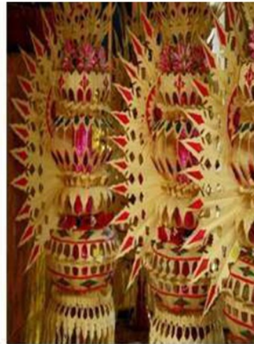
Figure C. Hiasan Janur

The comparison of interviews with religious literature guidelines in Bali that the implementation of yajna as in the form of yajna picture A, B.C not enough just known and understood it, but must be accompanied by pengayatannya, practice in the form of everyday behavior and the most important society. The intensity of prayer, prayerfulness, making upakāra will increase the attitude, morale and behavior towards a better and true quality of life in accordance with Dharma rules. Because each Upacara and Upakāra is a translation of the teachings of religion and has the essence of self-study, in organizing life and life, so that it can pursue the main goal of this birth, namely "Mokshartam Jagadhita" (welfare and happiness),