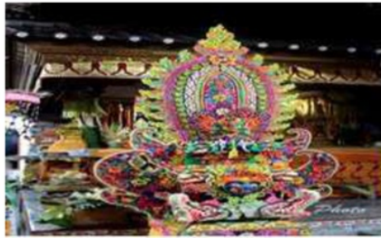
Figure A. Pregembal

The ceremony made in the city does not distinguish between the size of the bebantenan, but in the village, the ceremony for the formation of ceremonies can be done by the community, while the ceremony is considered to contain high magical meanings made by special people. The spending of money for small ceremonies can be done by the general public, while spending money for larger ceremonies is done by a special person. Where gender economic activity is associated with the eight characteristics ( Astaa iswaryanya ) that accompany each life of the people.