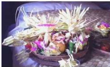
Figure B. Banten Otonan