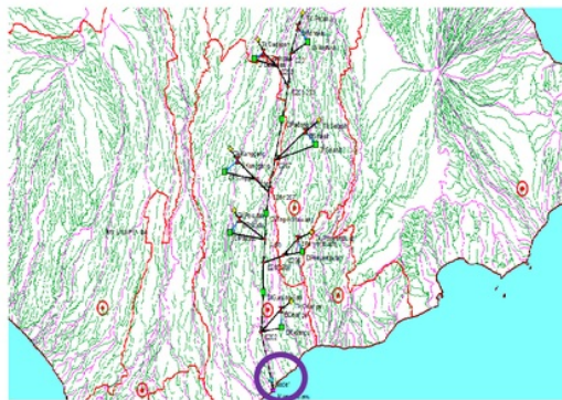
Fig. 2 The condition of the pattern of water in river estuary upstream to Petanu with RIBASIM

Based on the results obtained the flow velocity (V) average occurring in river estuary Petanu is 0.456 m / sec. The potential of water in River Basin until estuary Petanu based process using RIBASIM software input the data in the form of Hydrology (rainfall, evaporation), stream flow, water flow in river estuary of the results of measurements and maps Petanu watershed and the area irrigated. use of water to measure the amount of time half-month period then the following scenario obtained through a process and the results of the water system in the river estuary upstream to Petanu according to the water system map (Picture 2) and specifically for water management in the river estuary given circled. Water resources management in river estuaries Petanu can be implemented by making dams / reservoirs are located ± 300 m from the shoreline Saba Gianyar regency.