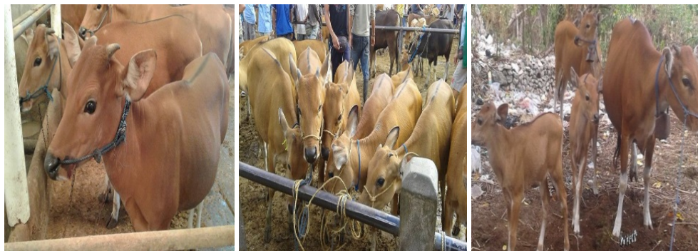
Figure 1. Animal Market in Bali

In managing breeders' farms, they always try to keep the costs spent to a minimum to obtain maximum production so that the business is economically profitable. Increasing profits automatically farmers' income and welfare will increase. Farm income is the profit obtained by farmers from the difference between the costs incurred during the calf marketing process. Farmer income from calf sales depends on the sex of the calf and the number of calf sold and the channels traversed by the calf marketing. Calculation of farmer's income can be done in two ways, namely: in whatever farms the farmer receives from selling calves, it is farmer's income because the farmer never counts the costs incurred during the production process, whether in the form of feed, cage depreciation or labor used. The second calculation by means of an economic calculation. Economic calculations result in our farmers never profit because no matter how small the costs incurred by farmers must be calculated including land rent, use of labor and others [8][17][21].